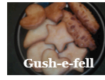
One tray $40