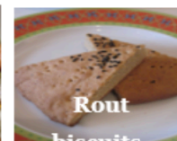
One tray rout $40