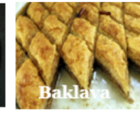
One tray $40

To order : Friba (951) 446 7426 Sherry (951) 907 1538 Selin (951) 237 2513