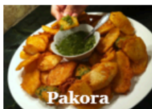
20 pc Pakora plate $30