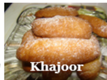
One tray khajoor $40