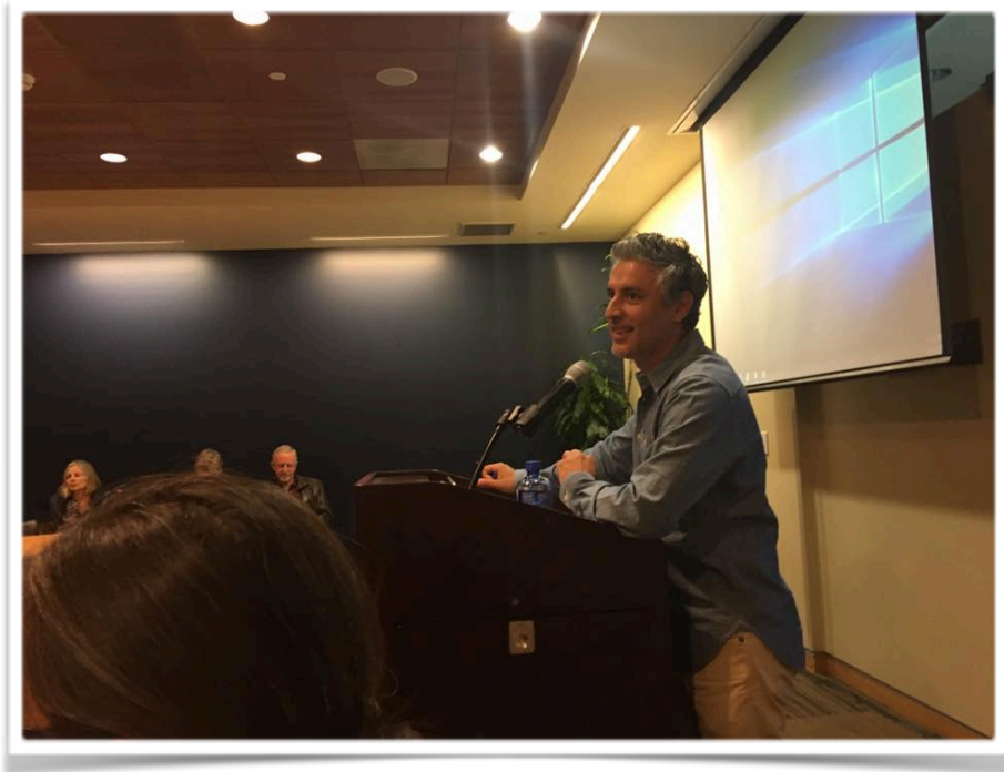
Dr. Reza Aslan