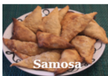
10 pc Samosa plate $20