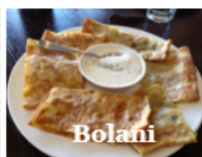
20 Bolani for $30